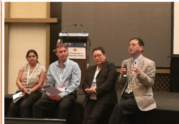
FOP WORKSHOP Q&A SESSION